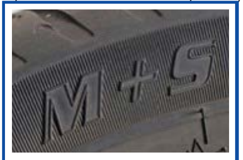
Mud and snow tyres (with the M + S symbol pictured above)

Tyres suitable for use in snowy and icy conditions experienced in extreme alpine environments: