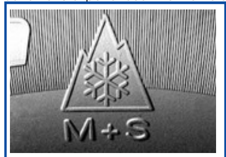
Snow tyres provide even better traction and are highly recommended (with the mountain/snowflake symbol pictured above)