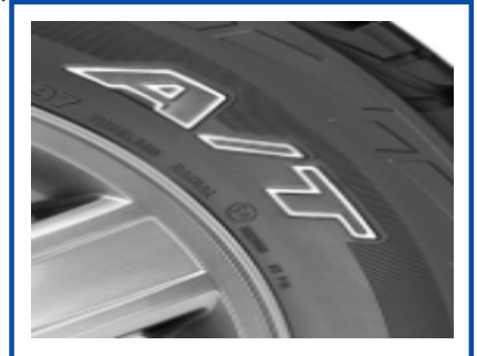
All terrain tyres (with the A/T symbol pictured above)

If tyres do not have either of these markings, a letter (on letterhead) from a tyre manufacturer or reputable tyre retailer stating the tyres fitted are suitable for use in extreme alpine environments and provide equivalent performance in snowy and icy conditions is required. The tyres below are not suitable: